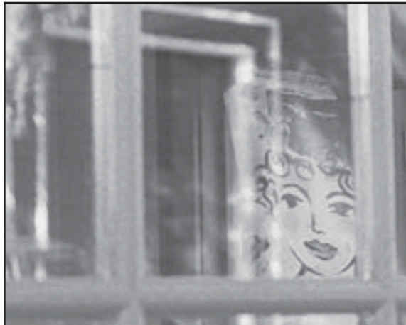
Two examples of Fred's digital art/photography.

With their range of involvement in the community, they were surprised at the diversity of interesting people who live here, their hope for change in our community would be ... “the development of a more open, constructive dialogue to consider the many policy options available to us for addressing local problems. Too often activists on both sides of the aisle focus on making the other side look bad rather than