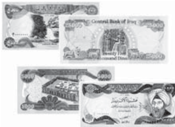
The new Iraqi Dinars are in Arabic and English.

economic growth include reopening and strengthening the commercial banking system, developing new sources of commercial and consumer credit, updating banking and commercial laws, and working with Central Bank and Ministry of Finance officials to strengthen monetary and fiscal policies.