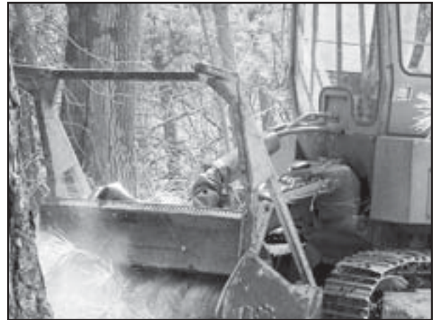
Don's brush-mulching machine at work.