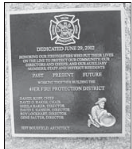
GCHNA was a proud contributor for this 49er Fire District plaque.