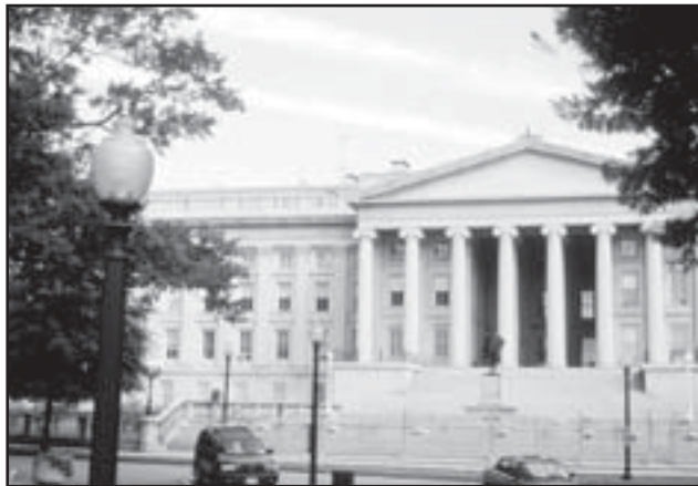
U.S. Department of the Treasury in Washington, DC

economies, the team in Baghdad supported by the Task Force in Washington is working on a variety of projects to rebuild the Iraqi economy after years of neglect and mismanagement. This involves a myriad of tasks to move Iraq from a centrally directed economy to an open market economy. Specific projects that will facilitate eco-